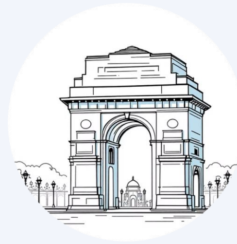
India DPDP regulations