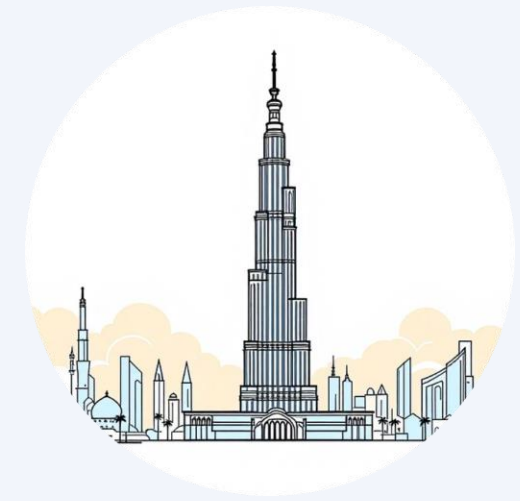
Saudi Arabia PDPL requirements