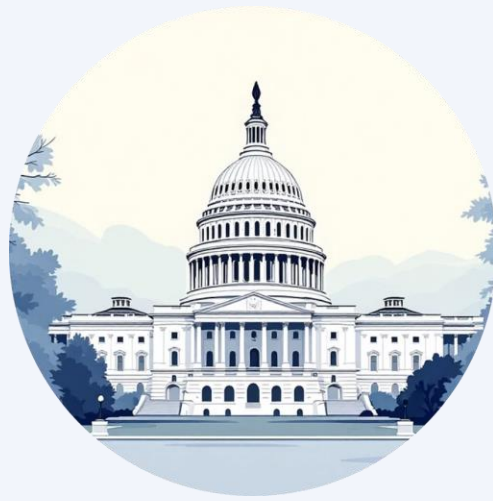
USA CCPA standards