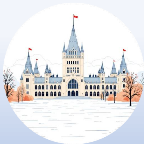
Canada PIPEDA guidance