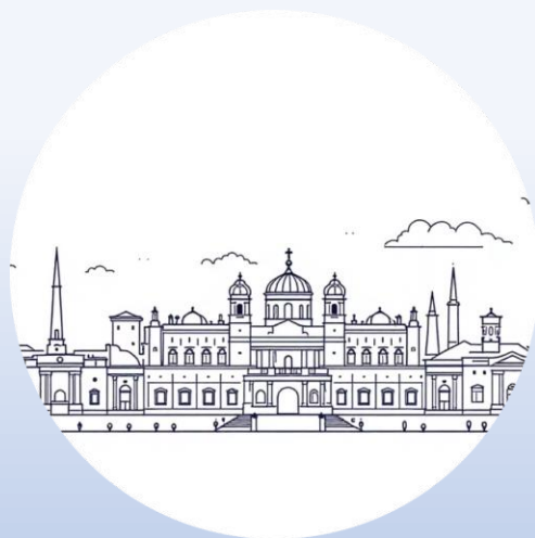
Serbia Personal Data Protection Law

Also covering Nigeria (NDPR) and Switzerland (Federal Data Protection Act) - as global as your business aspirations, as local as your markets.