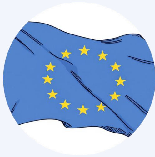
EU & UK GDPR compliance

Our methodology aligns with data protection regulations worldwide, embracing universally recognized privacy principles.